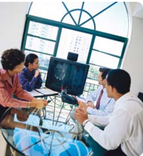
Fully leverage videoconferencing technology with One Touch

Realize the Full Potential with Measurement and Response Capabilities