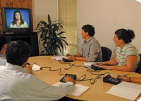
One Touch with Videoconferencing increases the effectiveness of communications and learning initiatives.