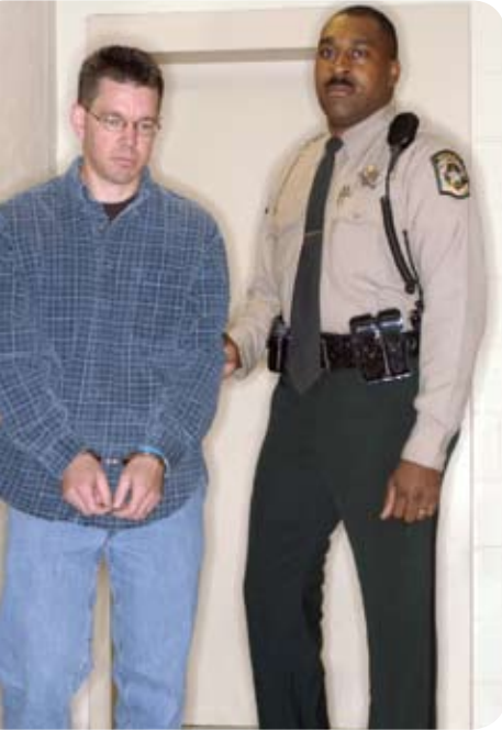
The work of correctional officers is increasingly complex.

“High scalability is one of the main reasons we chose One Touch. With One Touch we can quickly reach and communicate with massive numbers of people who otherwise wouldn't have had the opportunity.”